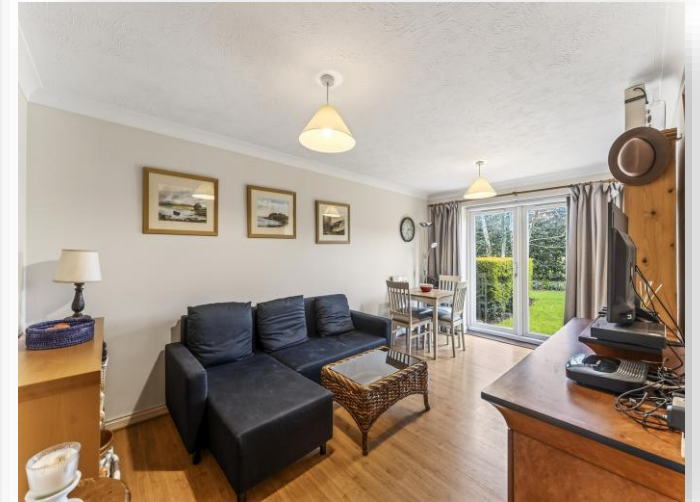
Peartree Avenue, London SW17 0JG