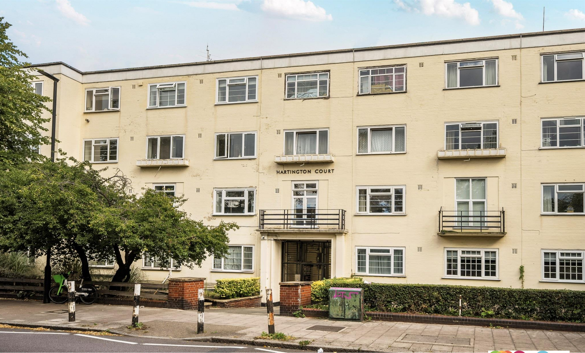
Hartington Court Lansdowne Way, London SW8