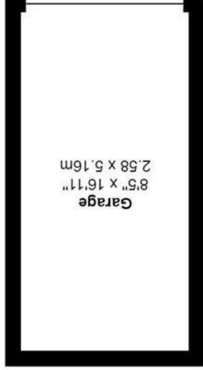
Alstord Close, Lightwater, GU18 5LF