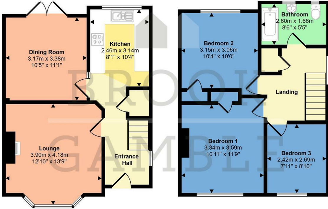
Ground Floor Approx 43 sq m / 461 sq ft

Approx Gross Internal Area 87 sq m / 934 sq ft