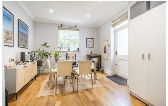
St. Stephens Crescent, W2