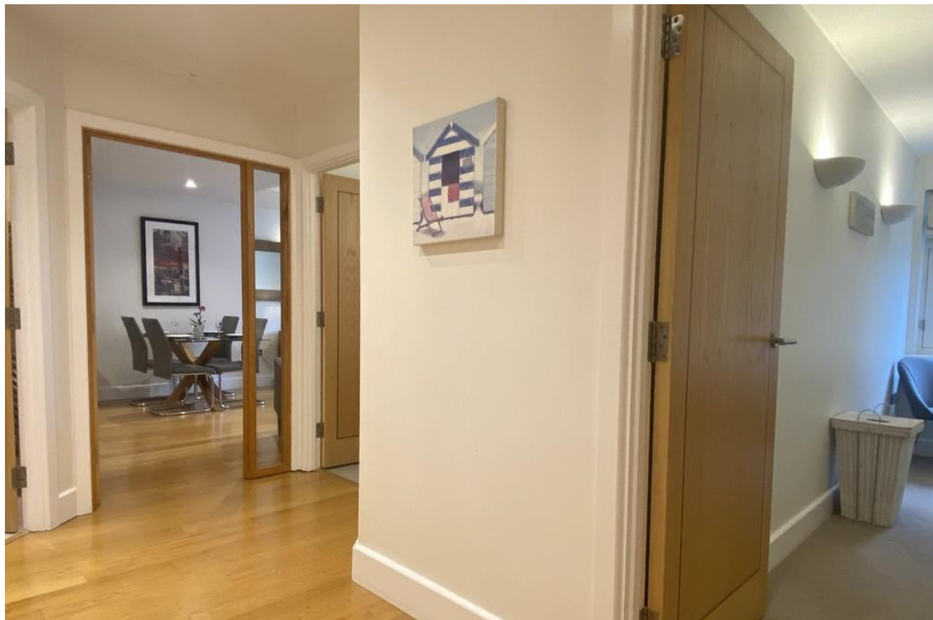
Chesterton Road, Cambridge