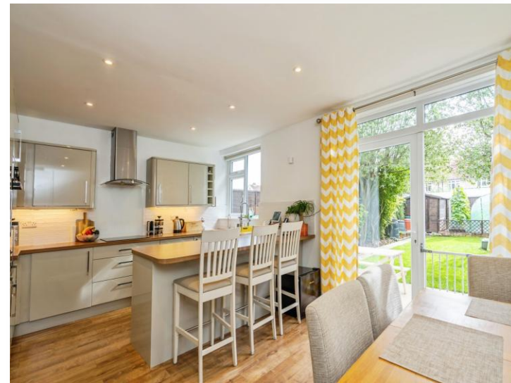
Linden Road, Bognor Regis PO21 2BB