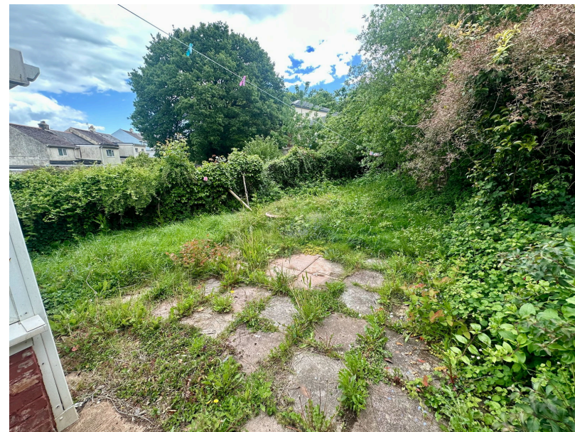
86 Longstone Road

RENOVATION OPPORTUNITY – Two Bedroom Semi-Detached Bungalow with Generous Gardens & No Onward Chain. Situated in a convenient and level location, this semi-detached bungalow offers excellent potential for buyers looking to modernise and create a home to their own taste. Ideally positioned close to local shops, schools and everyday amenities, the property is offered for sale with no onward chain. In need of full renovation throughout, the accommodation currently comprises two bedrooms, a lounge, kitchen, conservatory and entrance porch. Outside, the bungalow benefits from good-sized gardens surrounding the property, offering plenty of outdoor space and further potential. This is an ideal opportunity for investors, buyers seeking a project in a well-connected residential location.