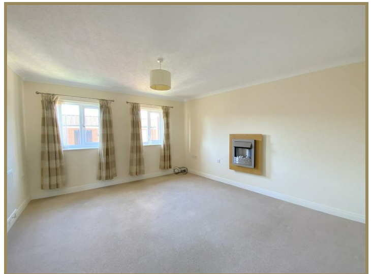
4, The Mews Hope Street, Cleethorpes, DN35 8RZ £135,000