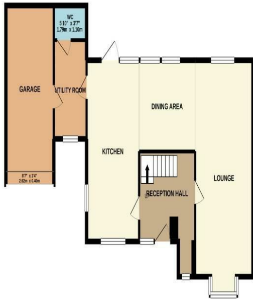
GROUND FLOOR 858 sq.ft. (79.7 sq.m.) approx.