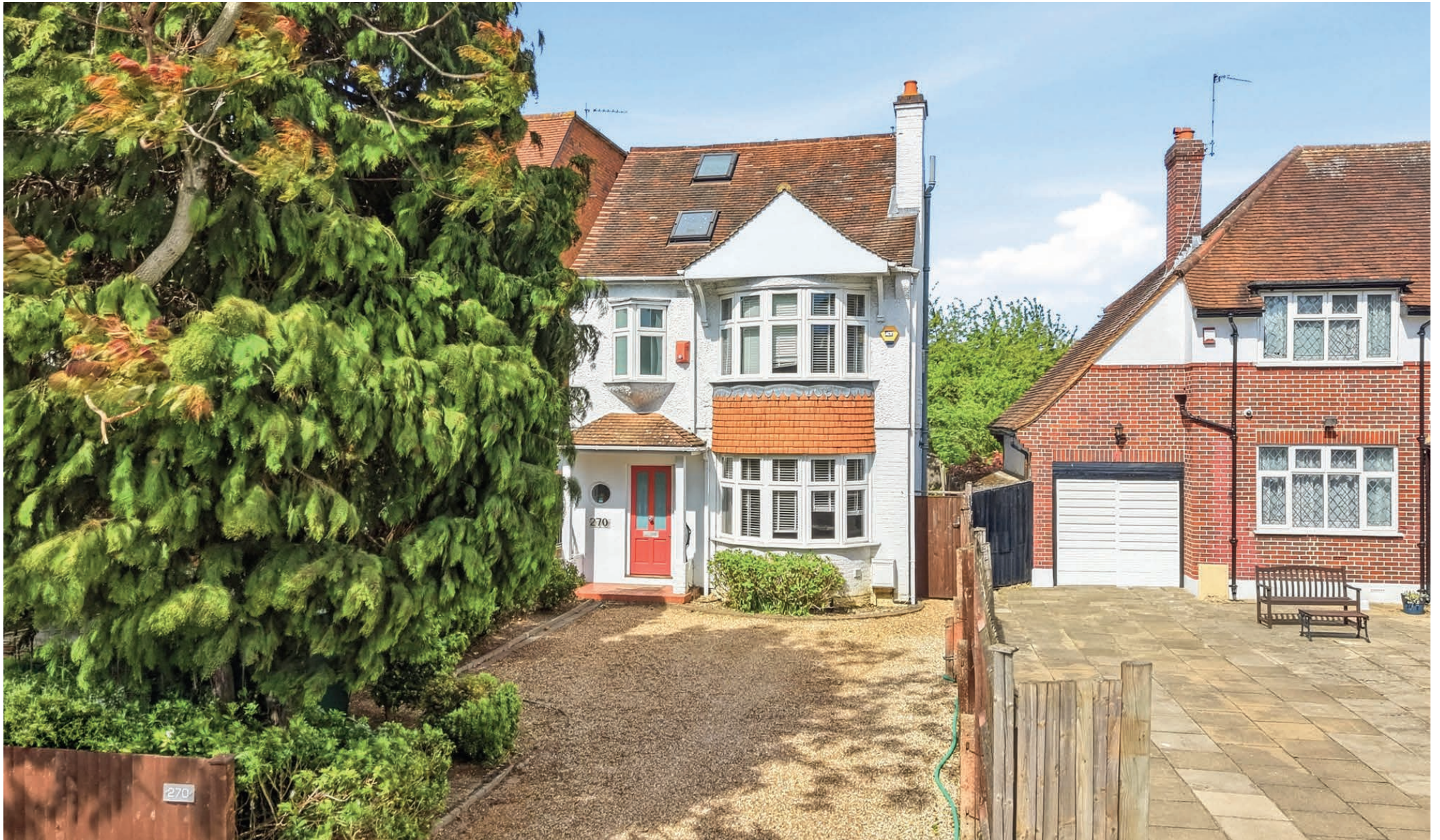
270 Coombe Lane West Wimbledon | SW20 0RW