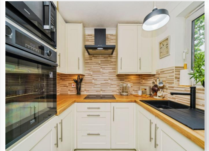
Greenways Court, Plymyard Avenue, Bromborough Wirral CH62 6BF