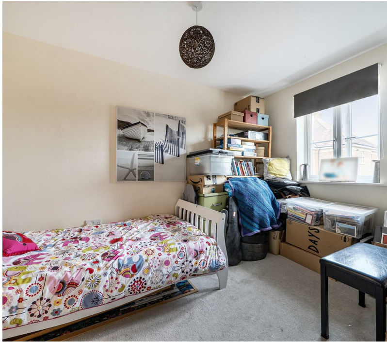
Houghton Way, Hailsham