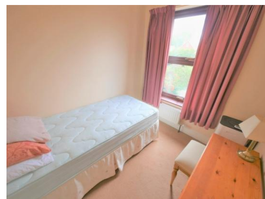
Bramford Road, Ipswich, IP1 4BA