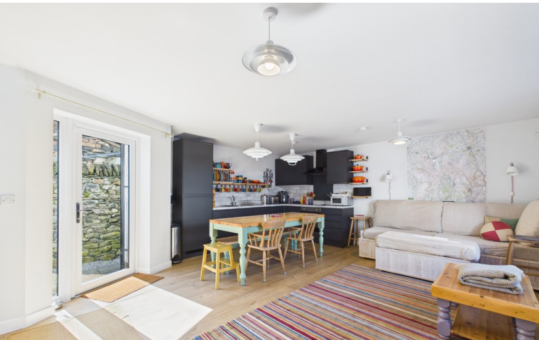
Open Plan Living Room / Dining Kitchen