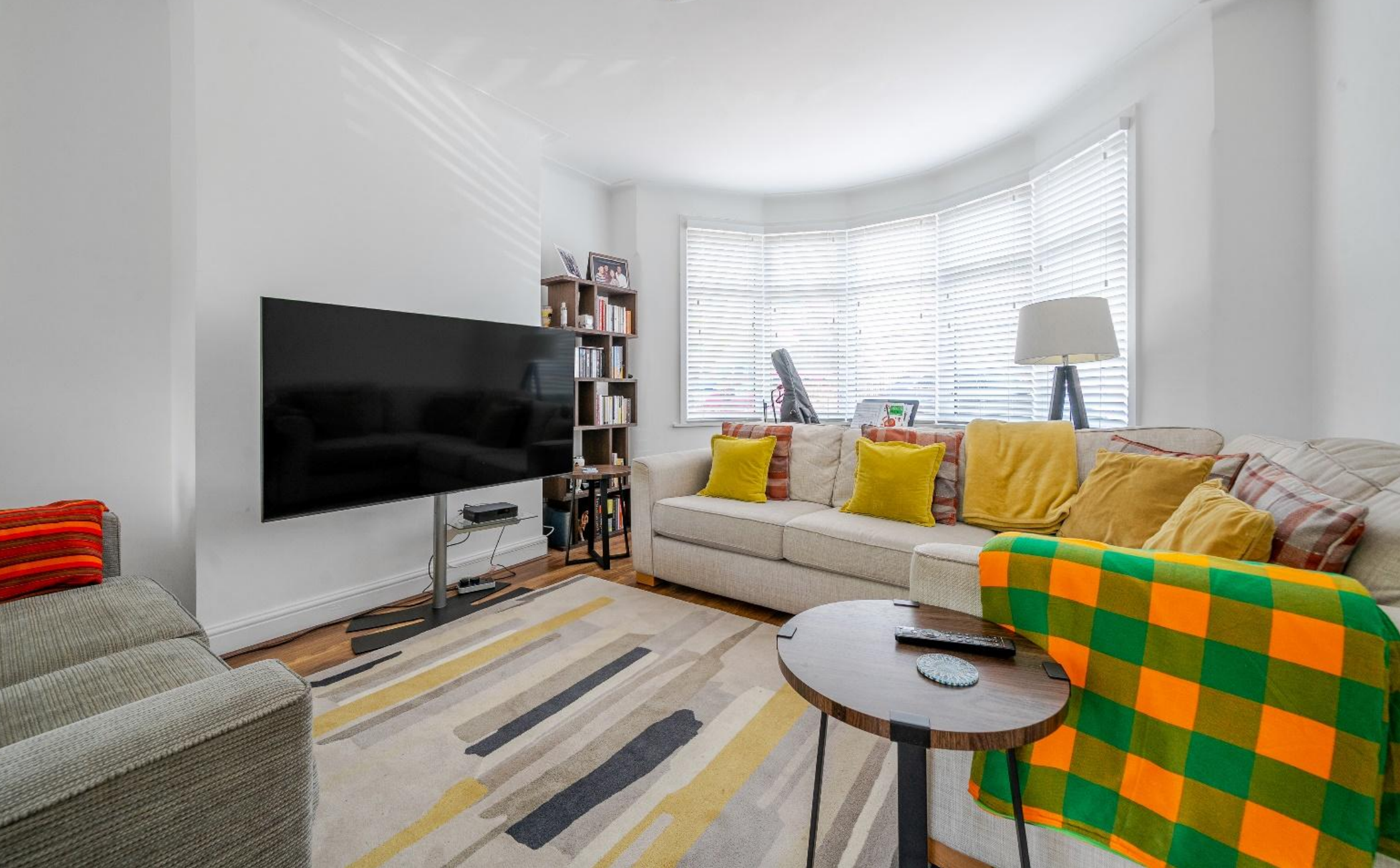
Ridge Crest, Enfield, EN2 8JX