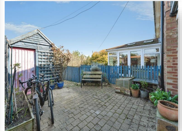
School Lane, Northwold, Thetford, IP26 5LL