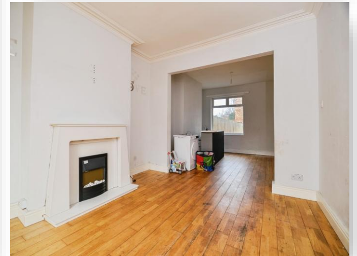
Durham Road, Stockton-On-Tees TS19 0DQ