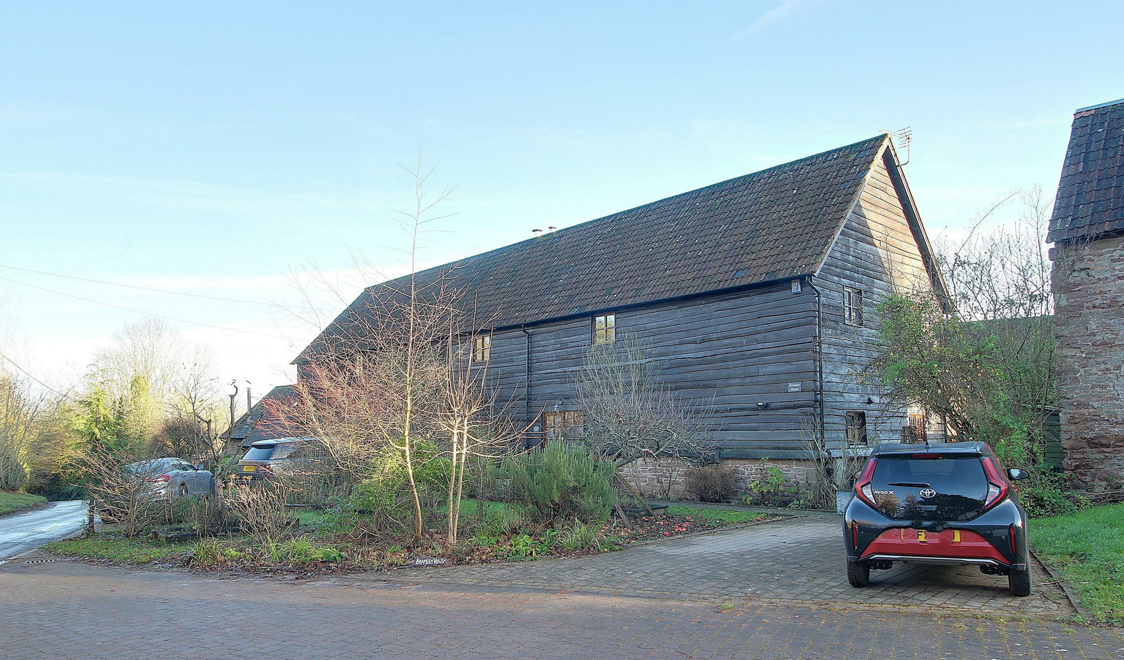
Bramley House , Linton, Ross On Wye HR9 7SD £650,000