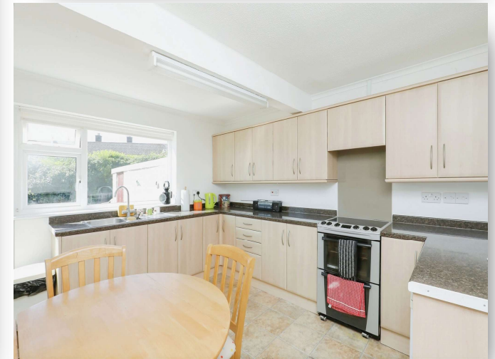
Back Lane, Mattishall, Dereham, NR20 3QX