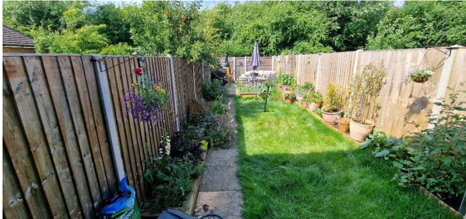
Garden in Summer 2025