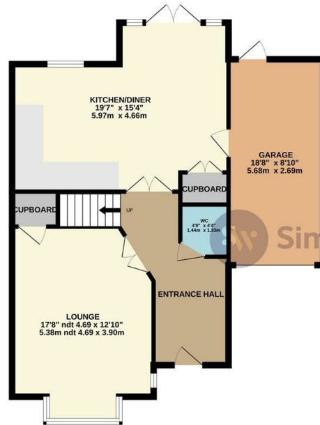
GROUND FLOOR 781 sq.ft. (72.6 sq.m.) approx.