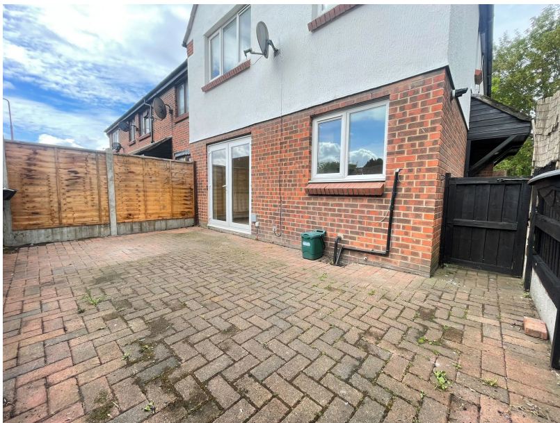
GROUND FLOOR 430 sq.ft. (40.0 sq.m.) approx.