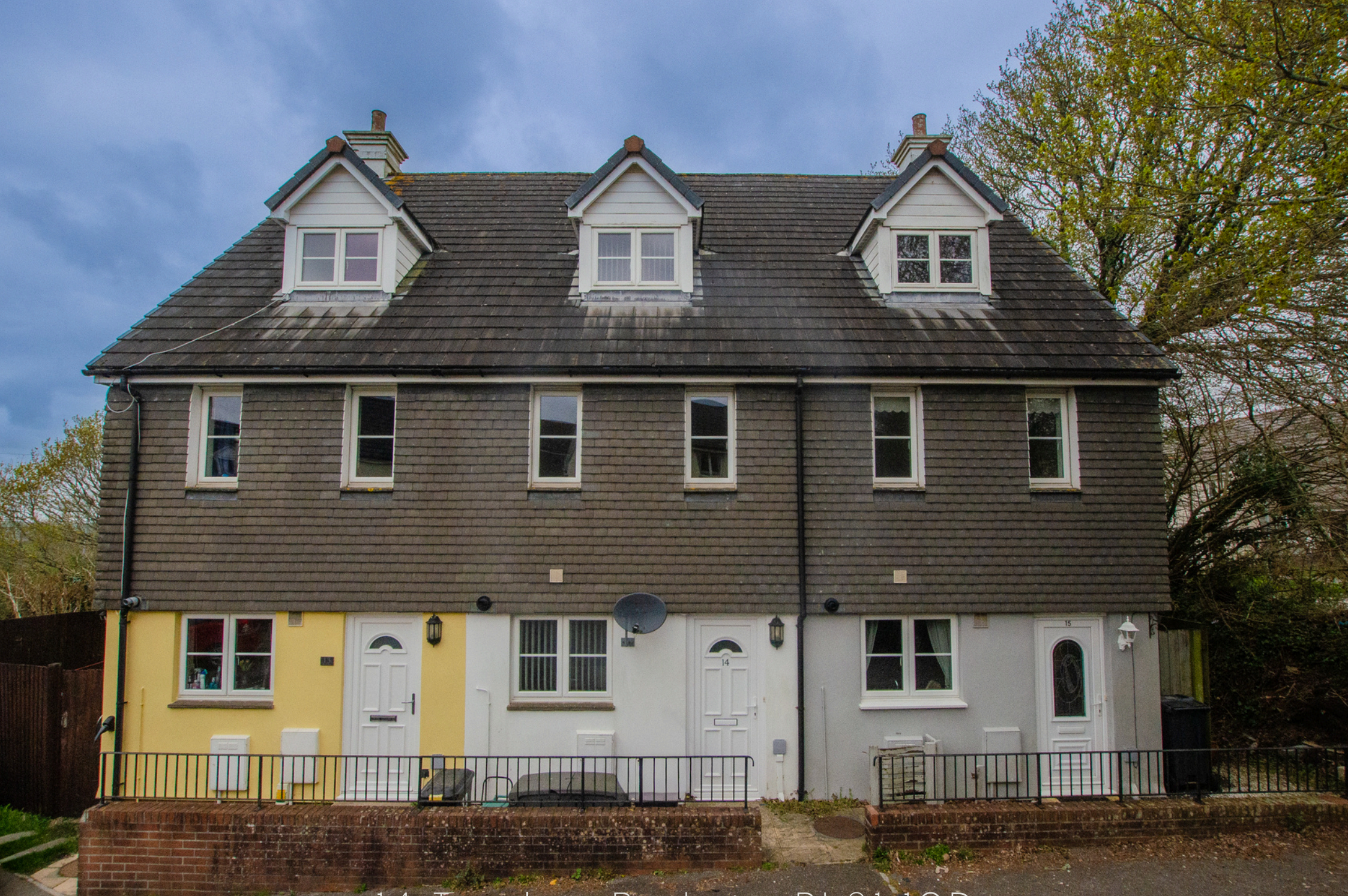
14 Tryelyn, Bodmin, PL31 1GD