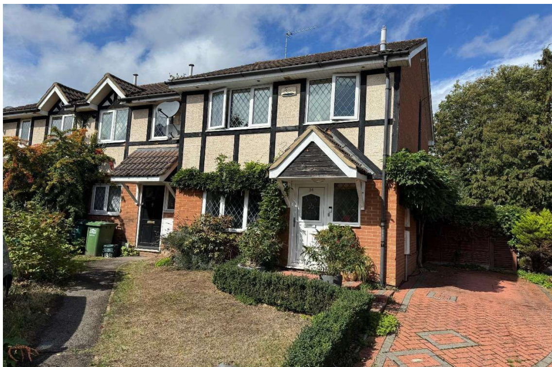
Sykes Drive, Staines-upon-Thames, TW18 1TA