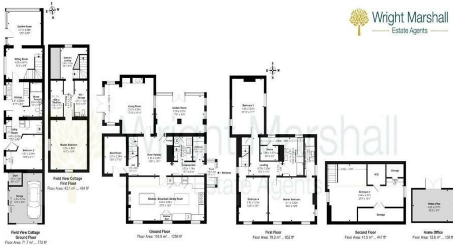
THE OLD STORES & FIELD VIEW COTTAGE, WOORE ROAD, BUERTON, AUDLEM, CREWE, CHESHIRE, CW3 0BT

All Building Parts Approximate Gross Internal Area: 365.3 m 2 ... 3932 ft 2 Whilst every attempt has been made to ensure accuracy, all measurements are approximate, not to scale. This floor plan is for illustrative purposes only and should be used as such by any prospective tenant or purchaser. Floor plan produced by Leon Sanoose from Green House EPC Ltd 2024. Copyright.