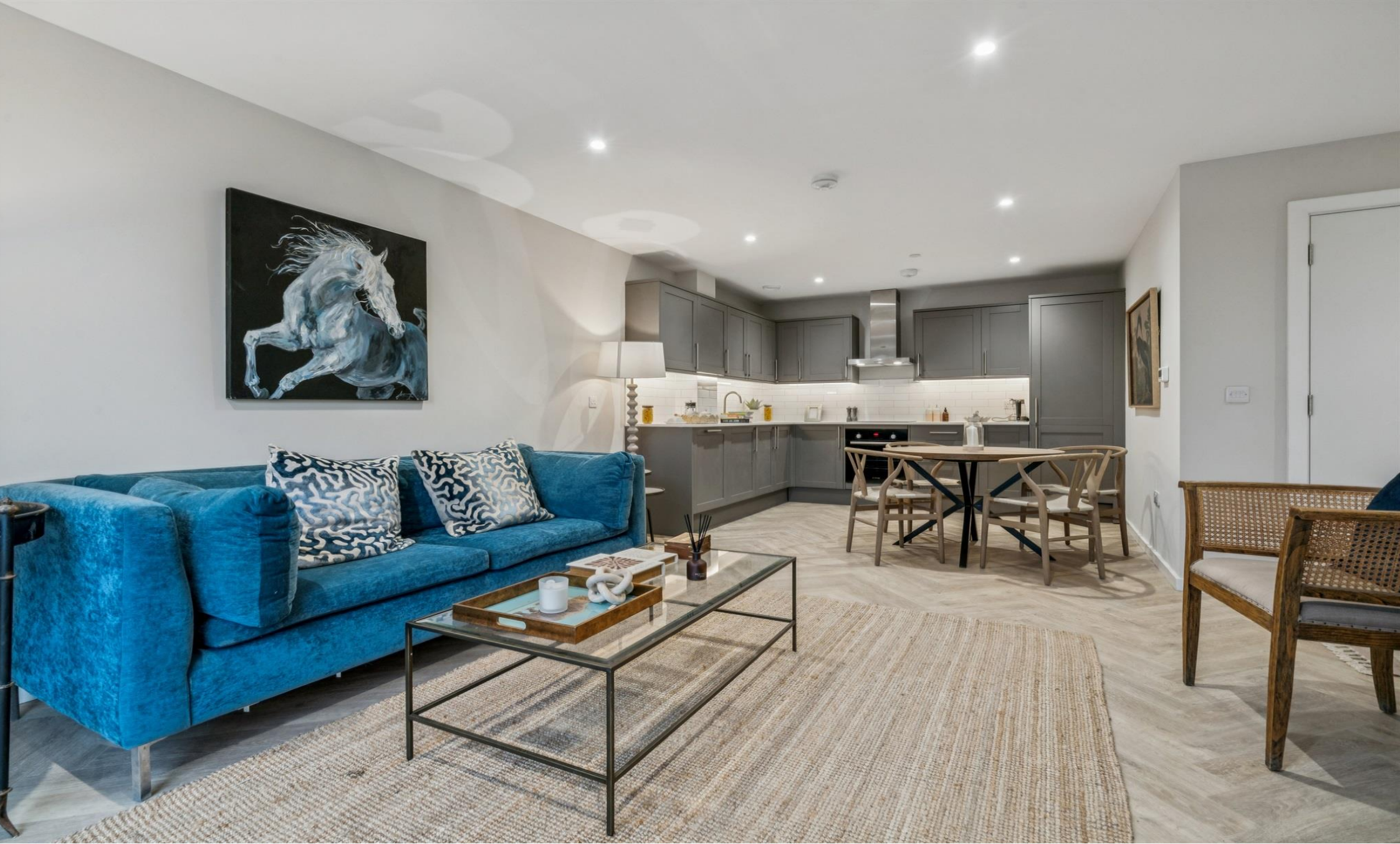
Meadow House Fallsbrook Road, London SW16 6DY