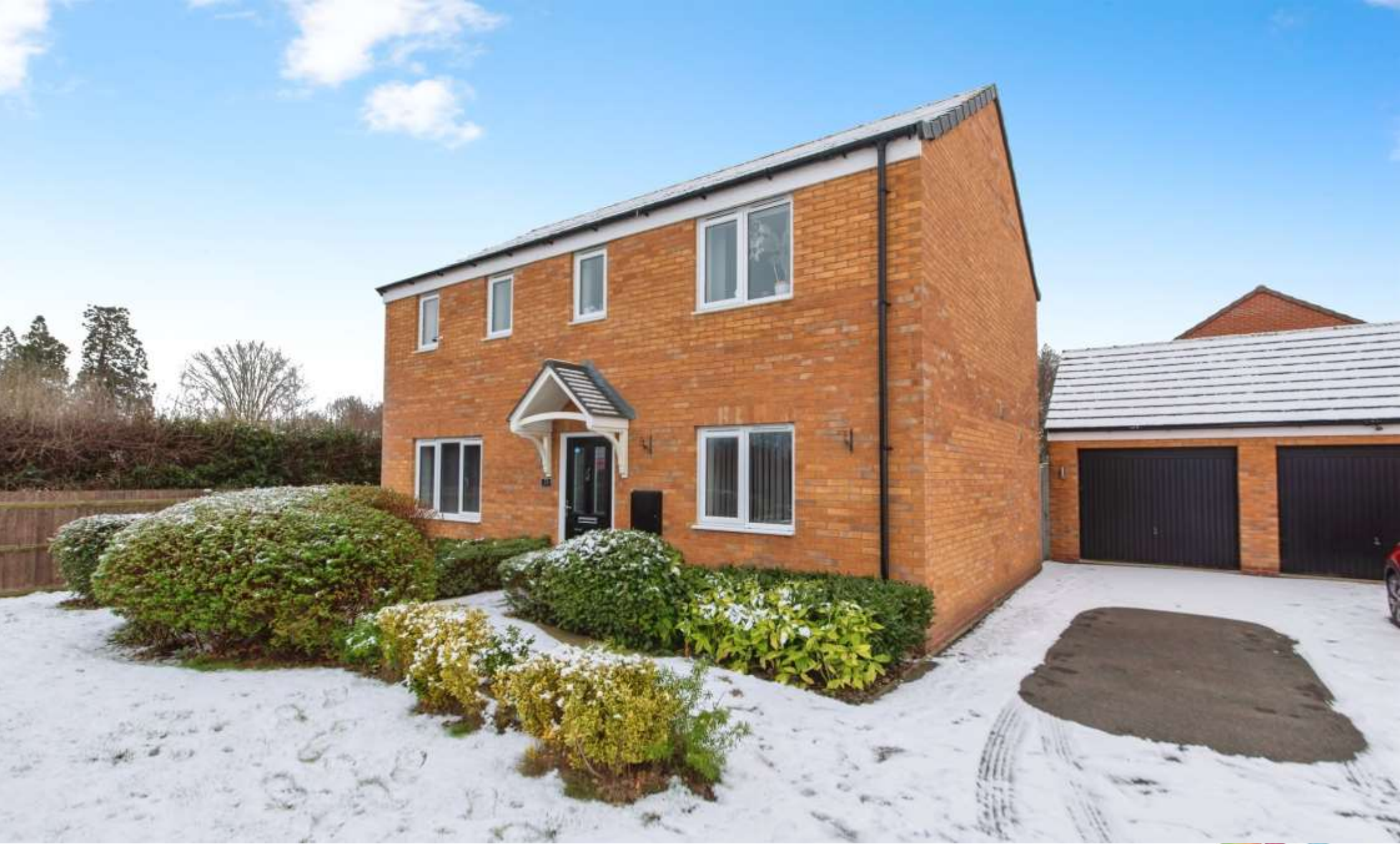
Swift Gardens, Kirton Boston PE20 1EQ