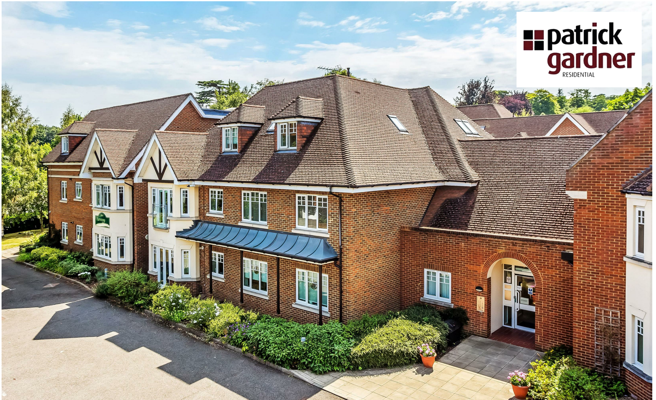
2 Harroway Manor, Cobham Road, Fetcham, Surrey, KT22 9LL