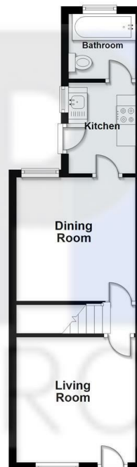
Ground Floor Approx. 31.8 sq. metres (341.9 sq. feet)