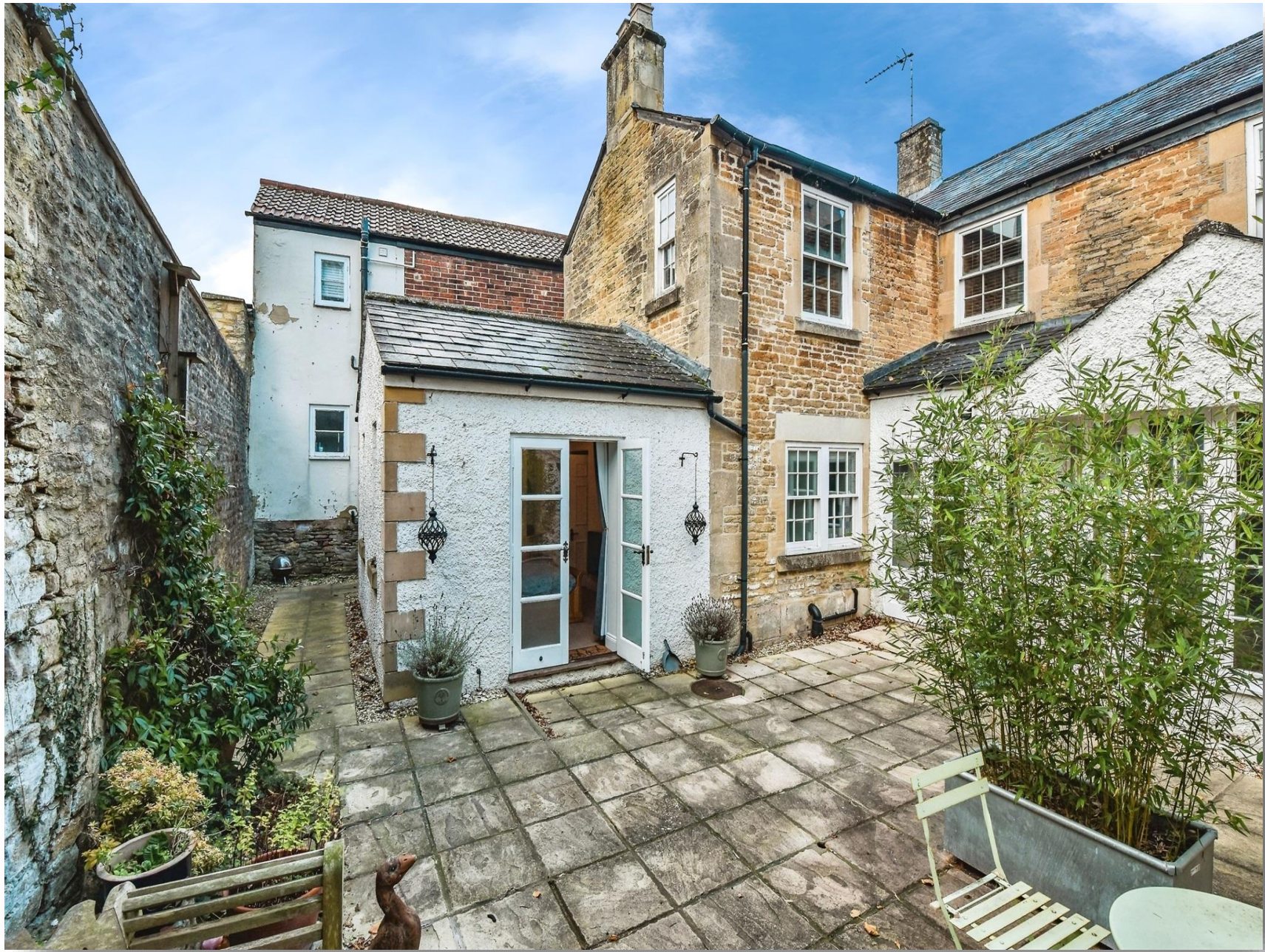
St. Mary Street, Chippenham SN15 3JJ