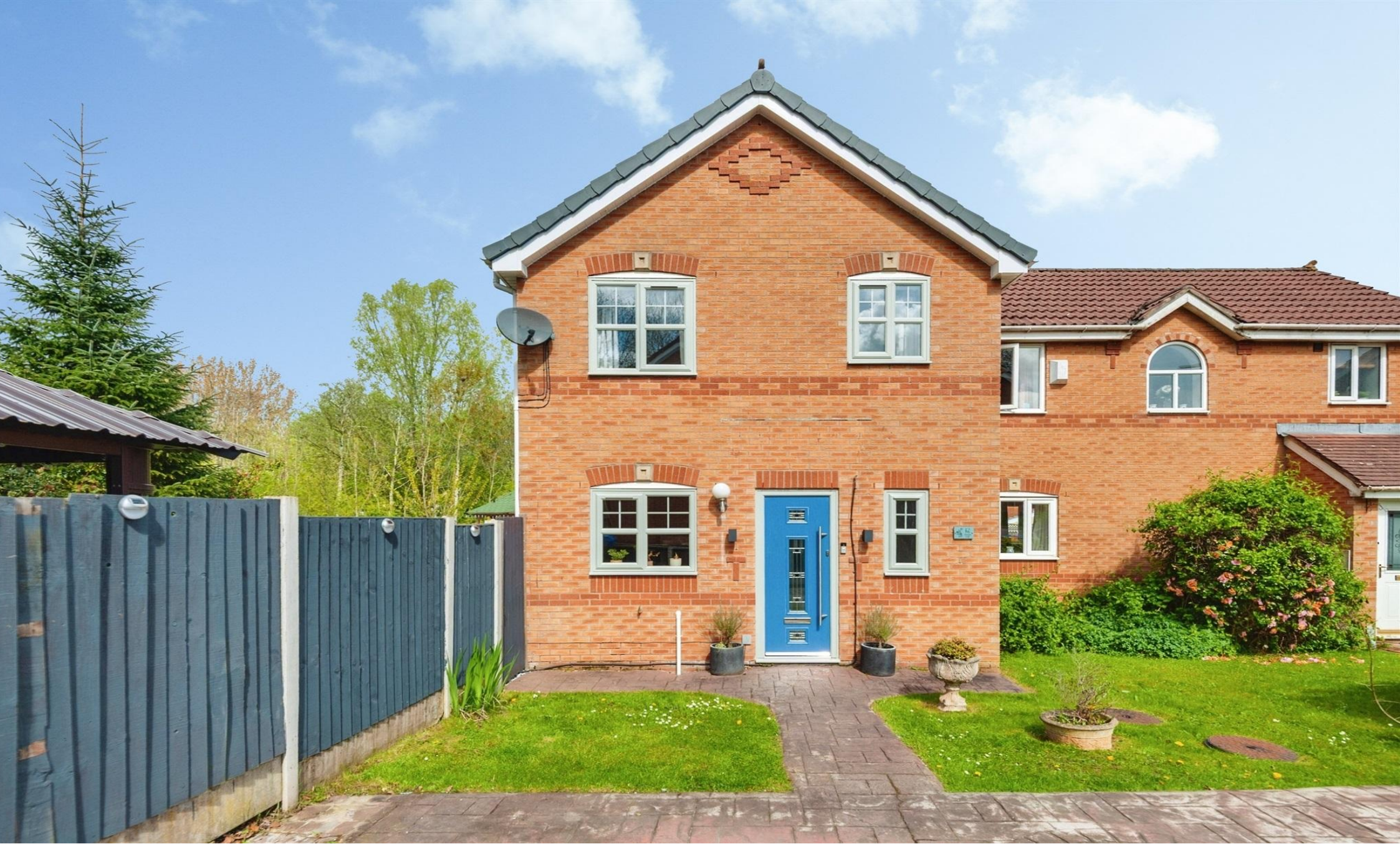
Manor Fell, Palacefields Runcorn WA7 2UZ