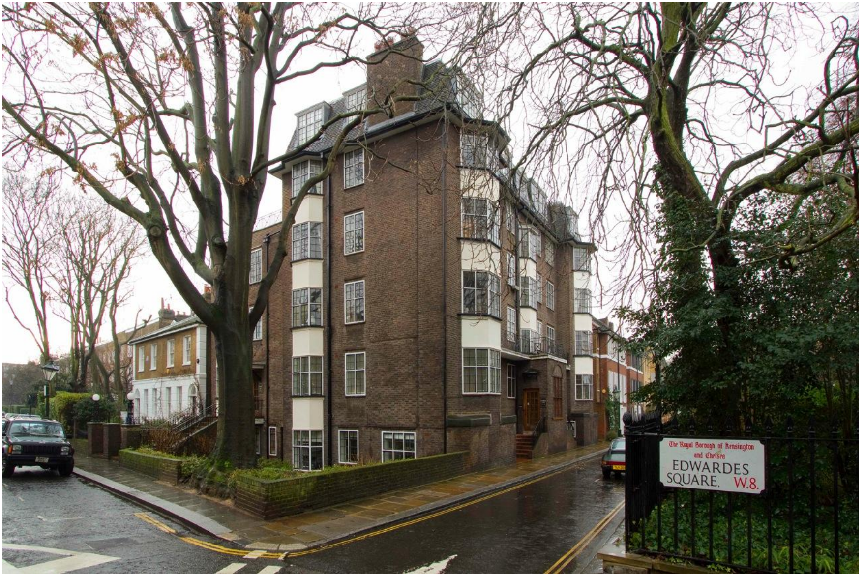
LCP House, Ogle Street, London W1W 6HU sales@lcpprivate.com 020 7723 1733