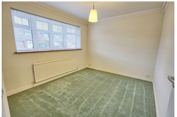
BEDROOM TWO 11'4" x 9'10" (3.46 x 3)