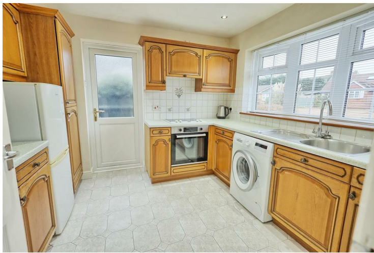
KITCHEN 10'8" x 9'2" (3.27 x 2.8)