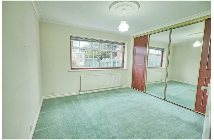
BEDROOM ONE 13'1" x 11'0" (4 x 3.36)