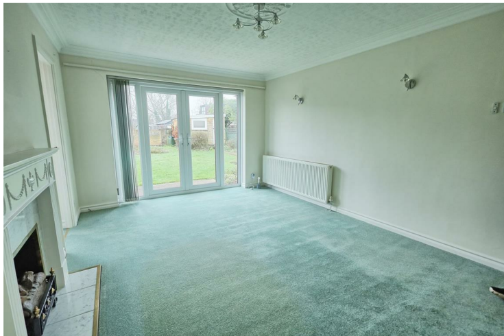
LIVING ROOM 15'4" x 12'4" (4.69 x 3.78)