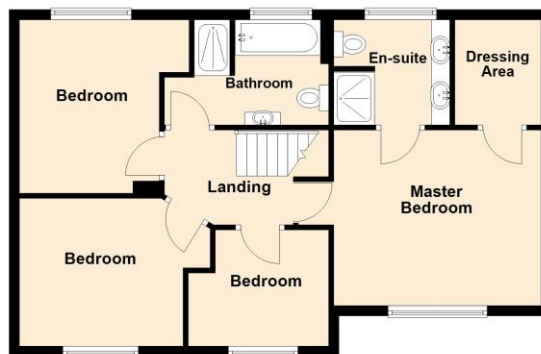
First Floor Approx. 62.4 sq. metres (671.2 sq. feet)

Total area: approx. 167.0 sq. metres (1797.7 sq. feet)