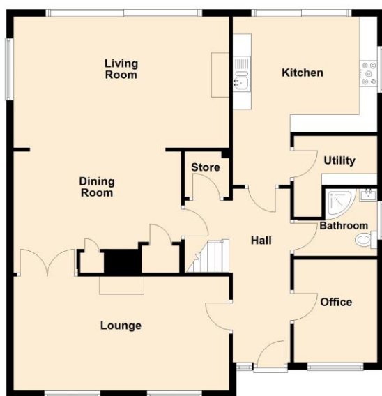
Ground Floor Approx. 104.7 sq. metres (1126.6 sq. feet)

To check broadband speeds and mobile coverage for this property please visit: https://www.ofcom.org.uk/phones-telecoms-and-internet/advice-for-consumers/advice/ofcom-checker and enter postcode WR10 3EL