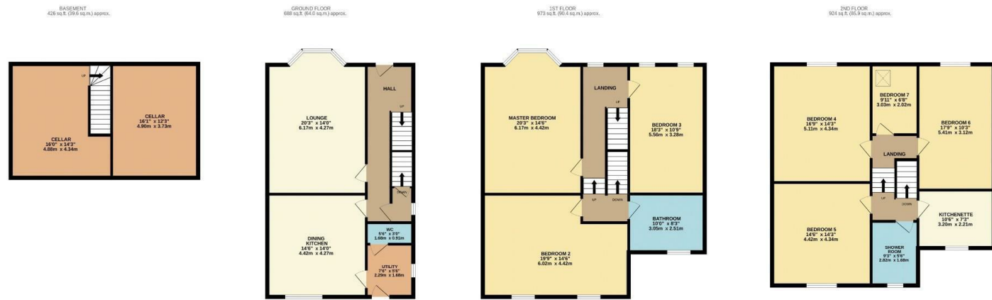
TOTAL FLOOR AREA: 3012 sq.ft. (279.9 sq.m.) approx.