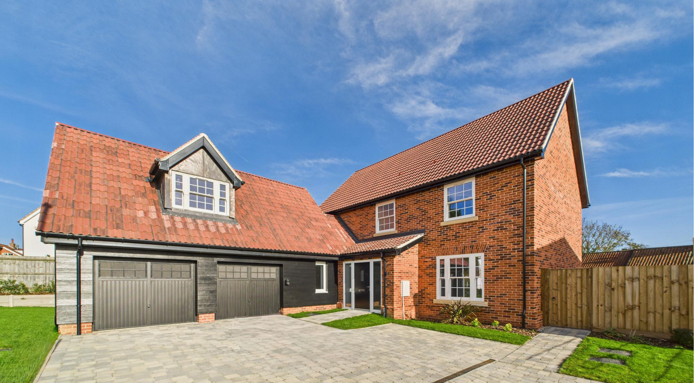
Birch House, Framlingham, Suffolk