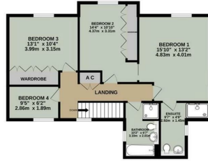
1ST FLOOR 788 sq ft, (74.2 sq.m.) approx.