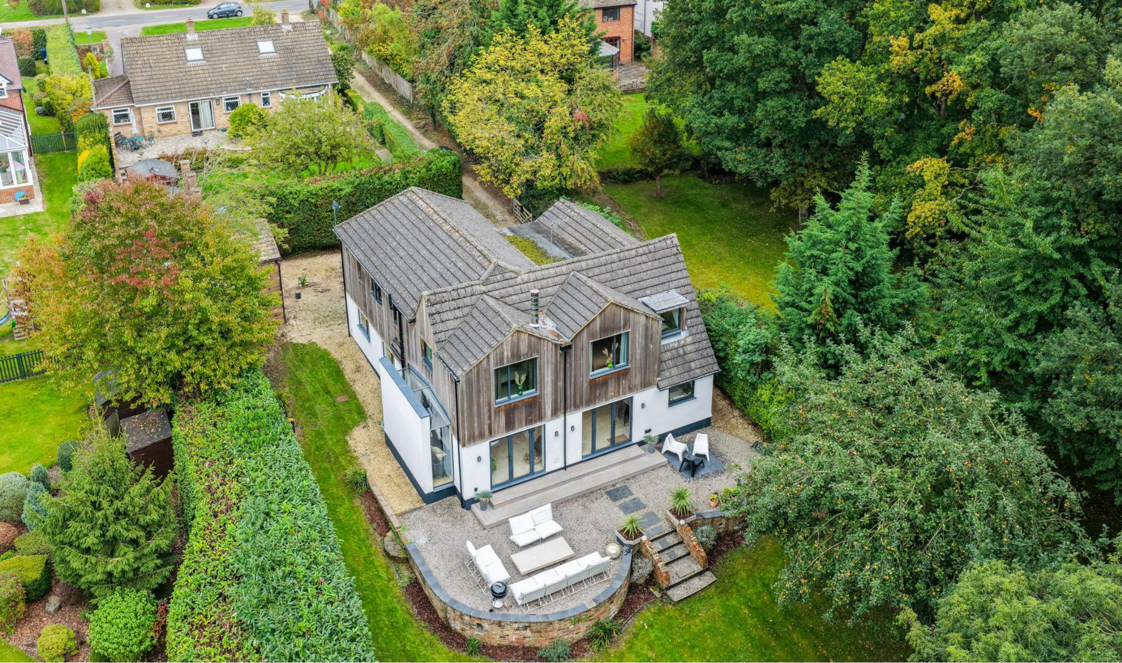
The Chalet Bellingdon, CHESHAM HP5 2XL