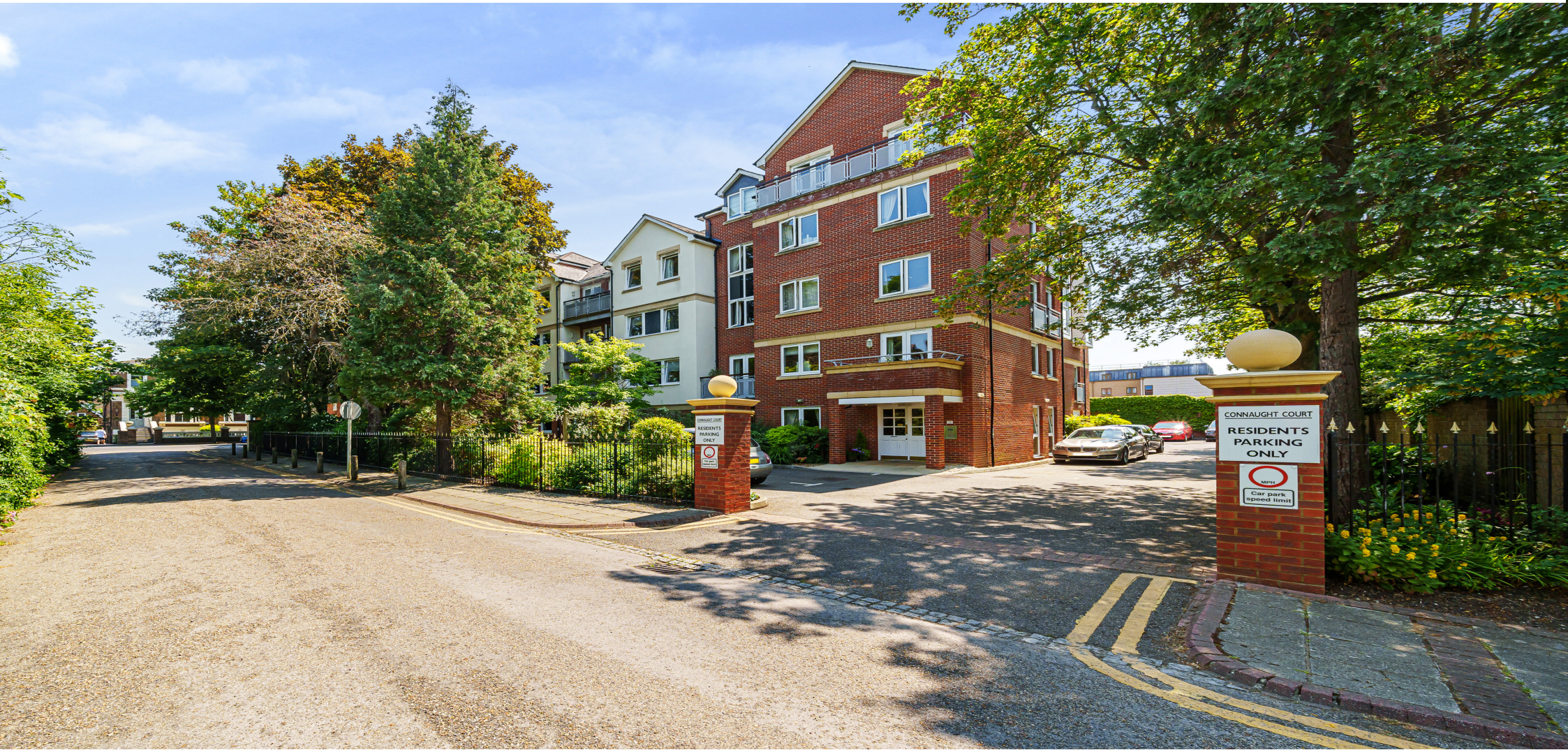
Connaught Court, Windsor