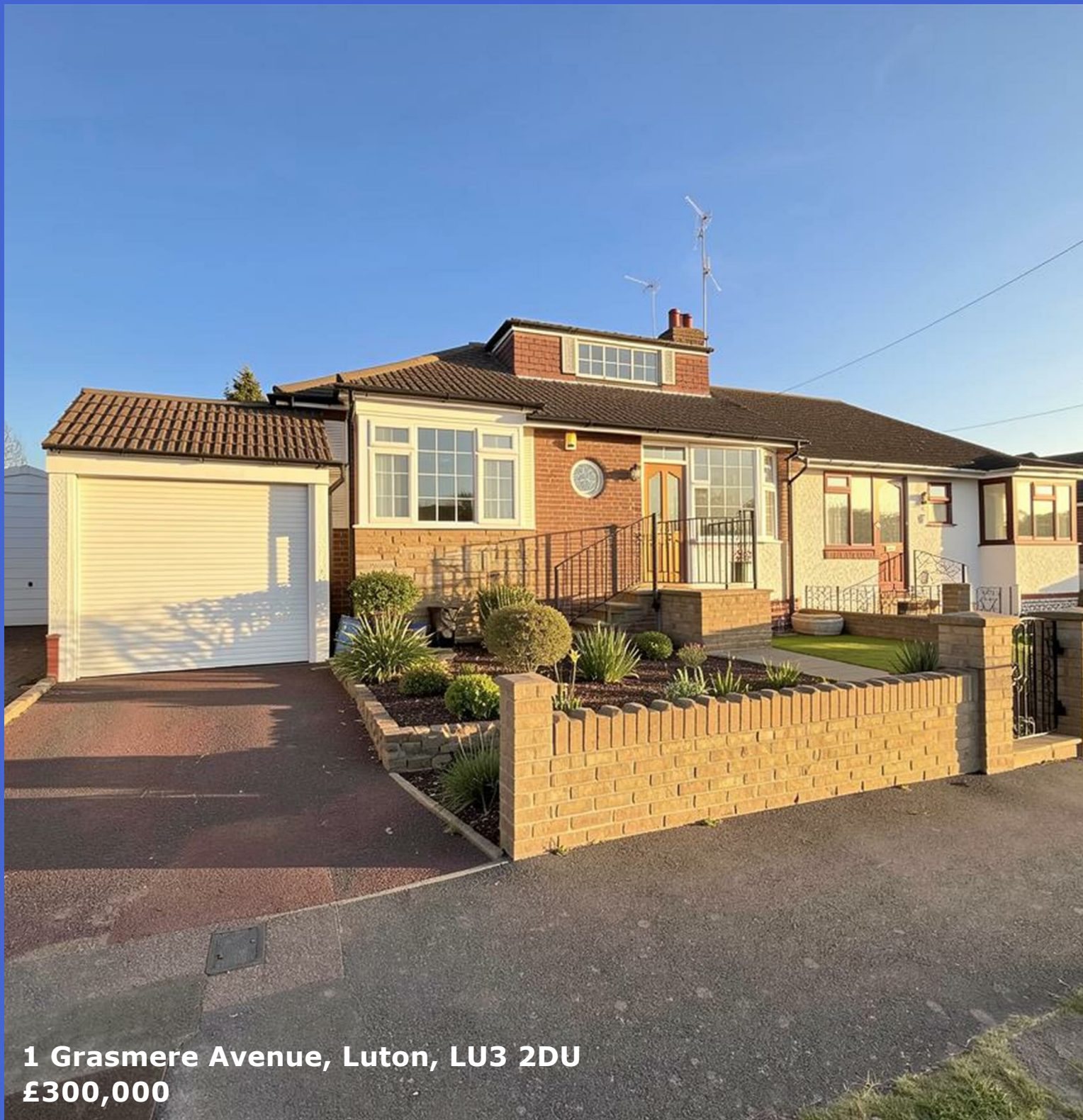
1 Grasmere Avenue, Luton, LU3 2DU £300,000