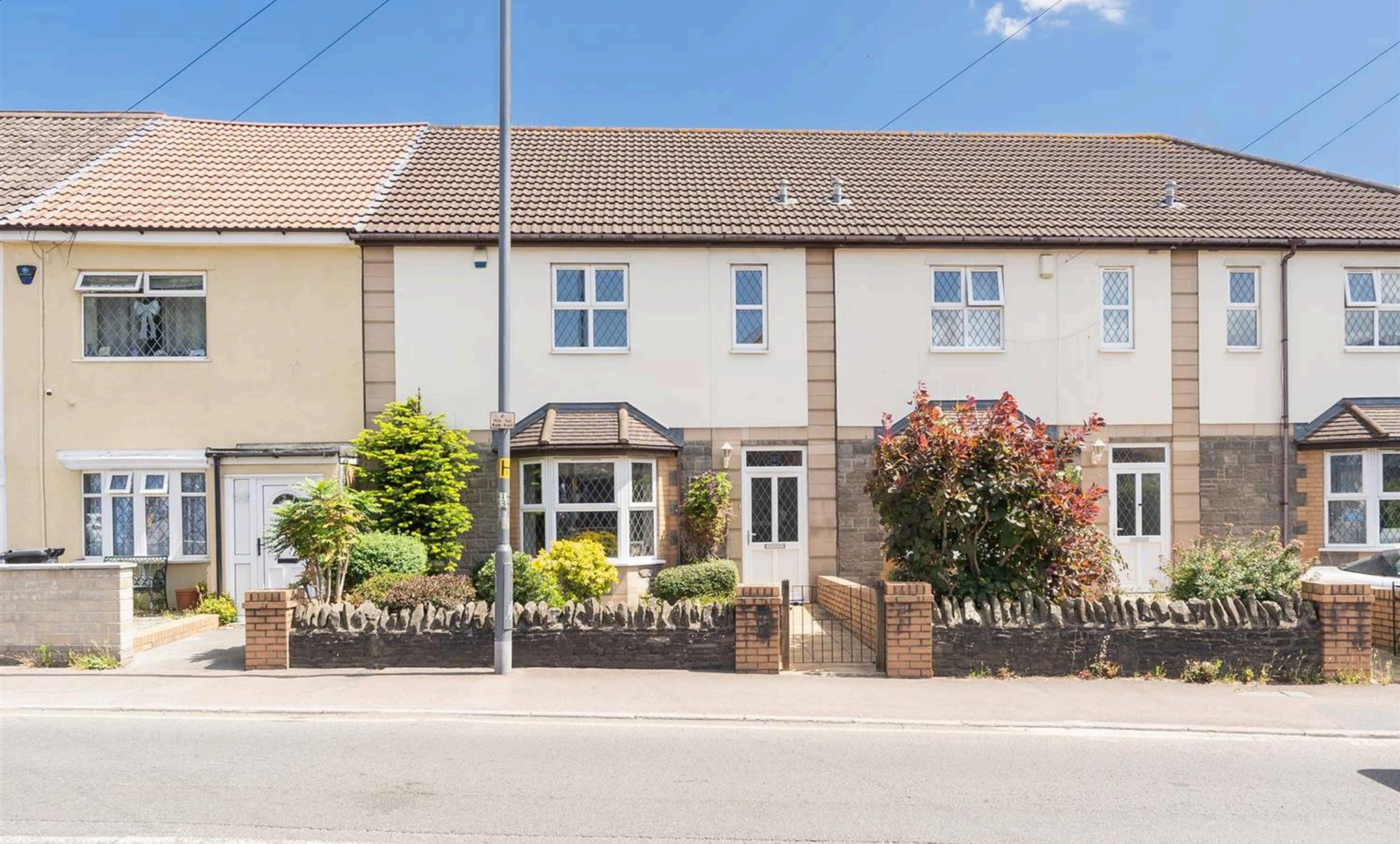
267 Soundwell Road, Bristol £350,000