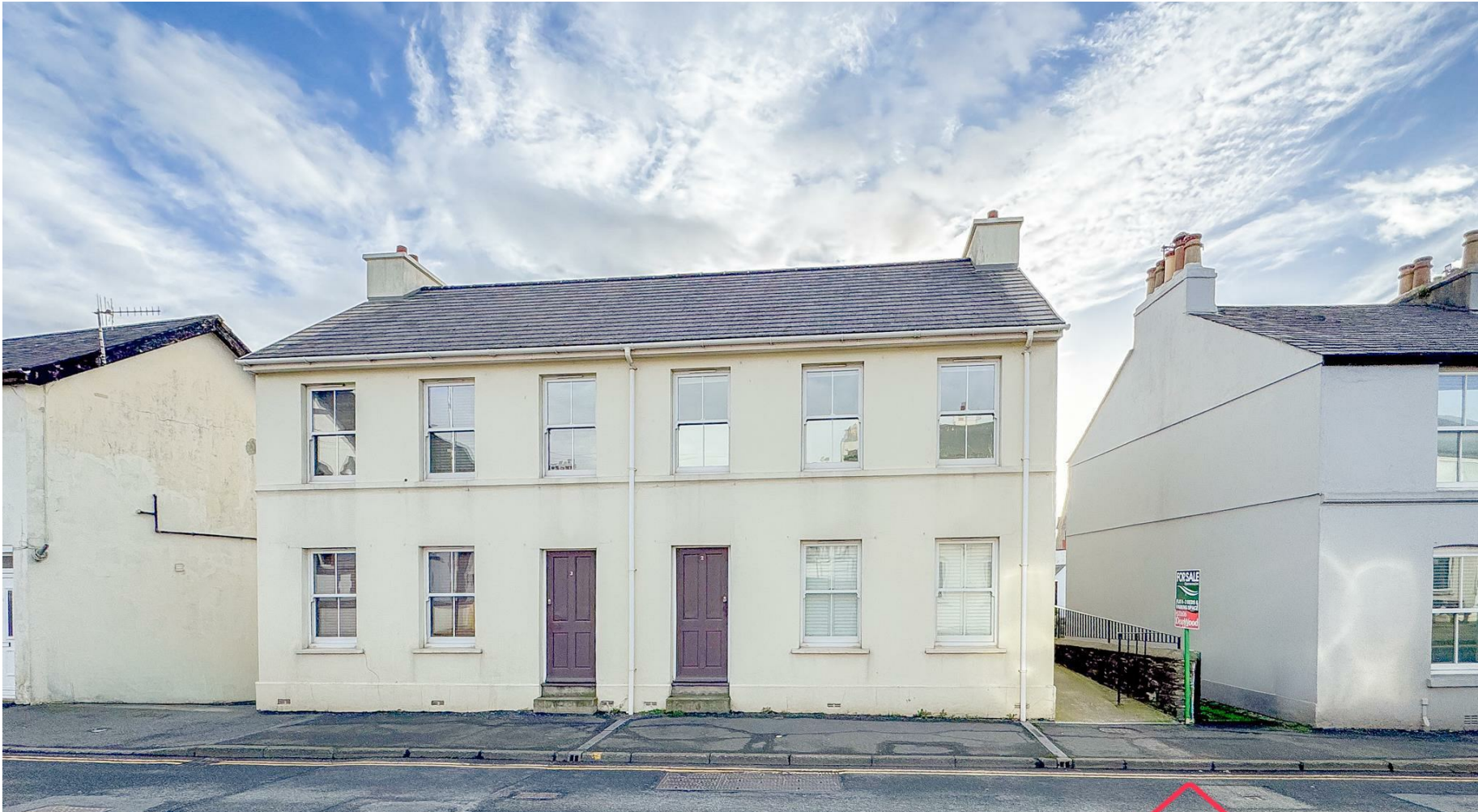
56 Main Road, Onchan, Isle Of Man, IM3 1AL Asking Price £212,000