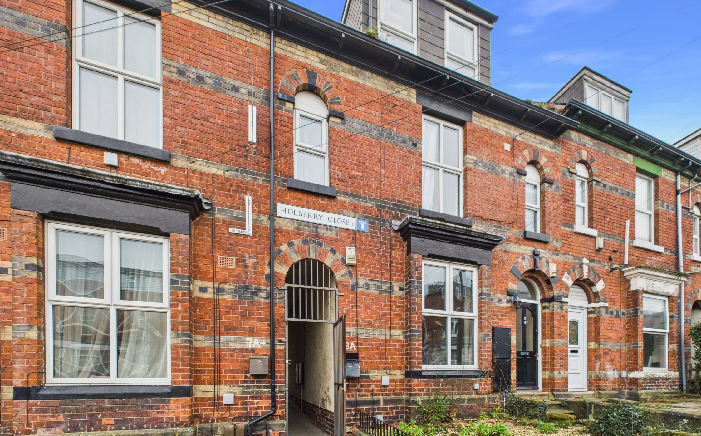
9 and 9A Holberry Close, Broomhall, Sheffield, S10 2FQ