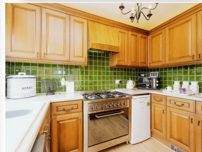
The Coach House Cromer Road, Mundesley Norwich NR11 8DB