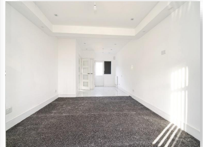
Melrose Doncaster Road, Mexborough S64 0JD