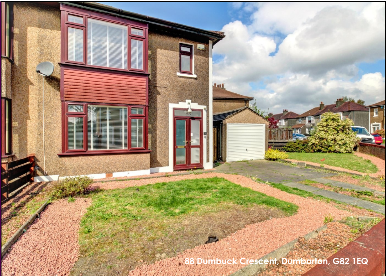
88 Dumbuck Crescent, Dumbarton, G82 1EQ

The agent presents to the market this generously sized and extended three-bedroom semi-detached villa, set within one of Dumbarton's most prestigious addresses to the east of the town.