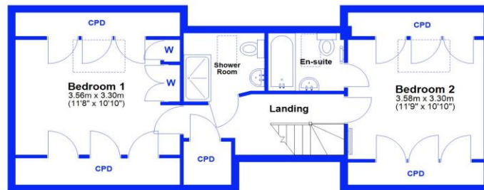
Total area: approx. 116.6 sq. metres (1255.1 sq. feet)

This floor plan has been prepared for the exclusive use of Barbers Estate Agents. All due care has been taken in the preparation of this floor plan which should be used for illustrative purposes only. All sizes and dimensions of rooms and walls are approximate. The positioning of windows, doors, openings, fixture and fittings are approximate and for use as a guide only. This floor plan is not, nor should it be taken as, a true and exact representation of the subject property. Plan produced using PlanUp.