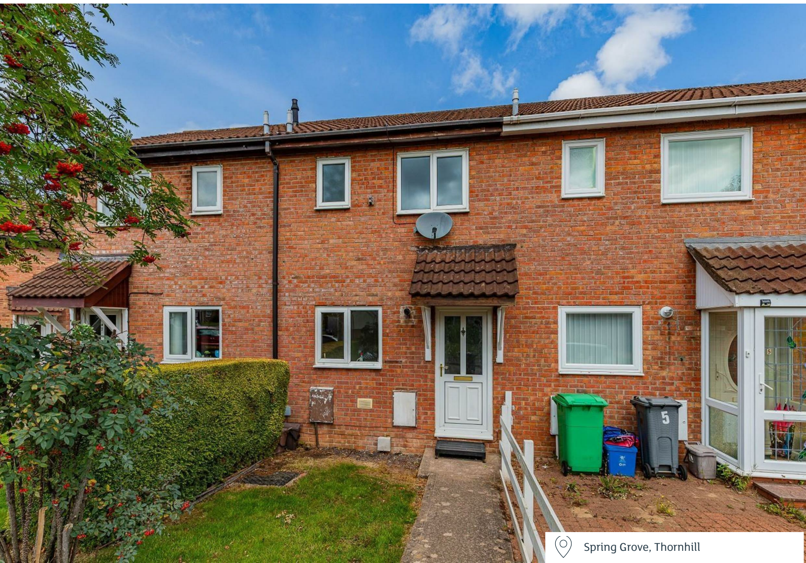
Spring Grove, Thornhill

All measurements are approximate and for display purposes only