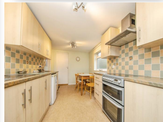
Church Crescent, Sroughton, Ipswich, IP8 3BJ